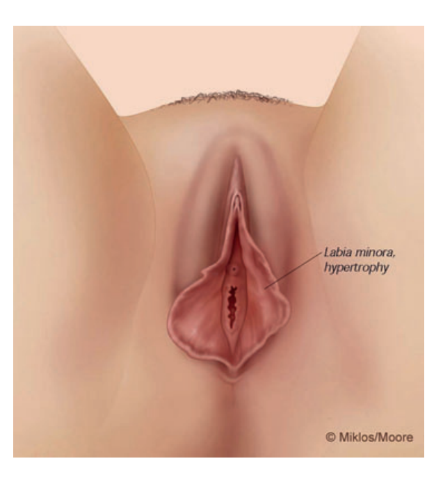
Figure 1 Bilateral labia minora enlargement.

Labia minora protruding past the distal edge of the labia majora can be of concern to women [5–7]. As mentioned earlier, this condition can constitute a functional or cosmetic problem. Such an enlargement can be bilateral or unilateral in nature. (Figures 1 and 2). Labia enlargement can be congenital as described by Caparo [8] and Radman [9], or can also be the result of androgenic hormones [10], manual stretching [8], and chronic irritation [11].